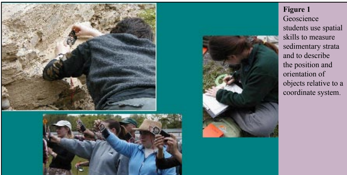
Figure 1 Geoscience students use spatial skills to measure sedimentary strata and to describe the position and orientation of objects relative to a coordinate system.

Although everyone thinks spatially, people do so in different ways and with varying degrees of confidence and success depending on