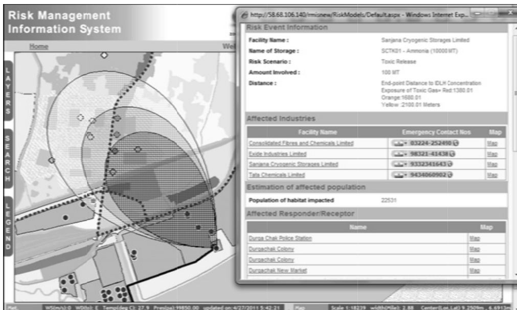
Figure 9.4: RMIS functional view in emergency response mode

At present, the practice of emergency management in India is still on the path to attaining maturity. The EPPRCA Rules envisage a four-tier crisis management system in the country – involving the Central Crisis Group, the State Crisis Group, the District Crisis Group and the Local Crisis Group to manage emergencies arising out of industrial operations. However, in actual terms, these groups are not functional in many industrial towns. In those where they function, they are often handicapped by the lack of sharing of information or its availability in the right form, and the coordination between different agencies and emergency responders is often weak. Discussions with administration and response personnel reveal that one of the key aspects that prevent efficient emergency management is the lack of updated and valid information available in the paper based on-site emergency management plans. Also, no computerized tool presently exists which can provide assistance to emergency responders to help tackle an emergency situation within short time, rather than reviewing a report to extract information which is often too time consuming.