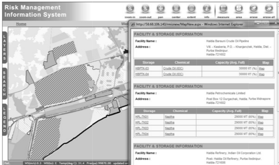
Figure 9.2: Querying RMIS for regulatory planning

Understanding the requirement for updated information on hazard sources, chemical substance and other risk related data, a need has been felt to make a transition towards more risk-informed regulations enabling transparent sharing and exchange of information between the competent authority and the hazardous facilities, and wherever required with the stakeholders. Using the RMIS, competent authorities can readily access regulatory information and reports for all hazardous industries within a MAH industry cluster along with full understanding of spatial locations of such storages and activities. The presence of consolidated information in a single database can aid in regulatory planning activities - like understanding overall hazard potential in an area. This is illustrated through a search in the RMIS to identify MAH industries which store flammable hazardous chemical of quantity more than 10,000 metric tons, as in Figure 9.2 below.